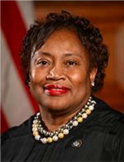
Hon. Shirley Troutman Associate Judge

New York State Court of Appeals 20 Eagle Street Albany, NY 12207