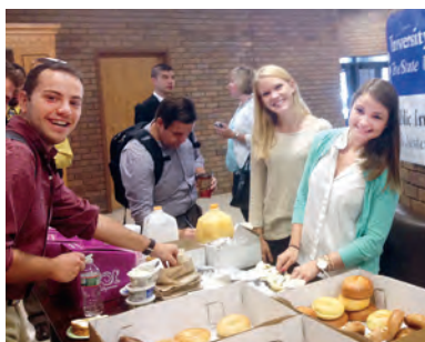
The Buffalo Public Interest Law Program (BPILP) held a bagel breakfast in the lobby of O'Brian Hall to welcome new students.