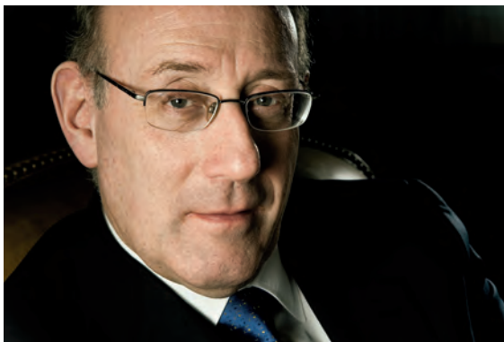
Kenneth R. Feinberg, the Gerald S. Lippes lecturer, will speak on “Settlements and Compensation Funds.”

The event’s keynote speaker will be Kenneth R. Feinberg , an attorney who has overseen the administration of compensation funds established on behalf of the victims of the 9/11 World Trade Center attack, the Deepwater Horizon oil spill, the Boston Marathon bombing, and several other high-profile mass disasters and mass torts. Feinberg, founder of the Feinberg Rozen law firm and currently a lecturer at Harvard Law School, will speak on “Settlements and Compensation Funds.” His 8:30 a.m. address will also serve as the annual Gerald S. Lippes Lecture, with co-sponsorship by the University at Buf-