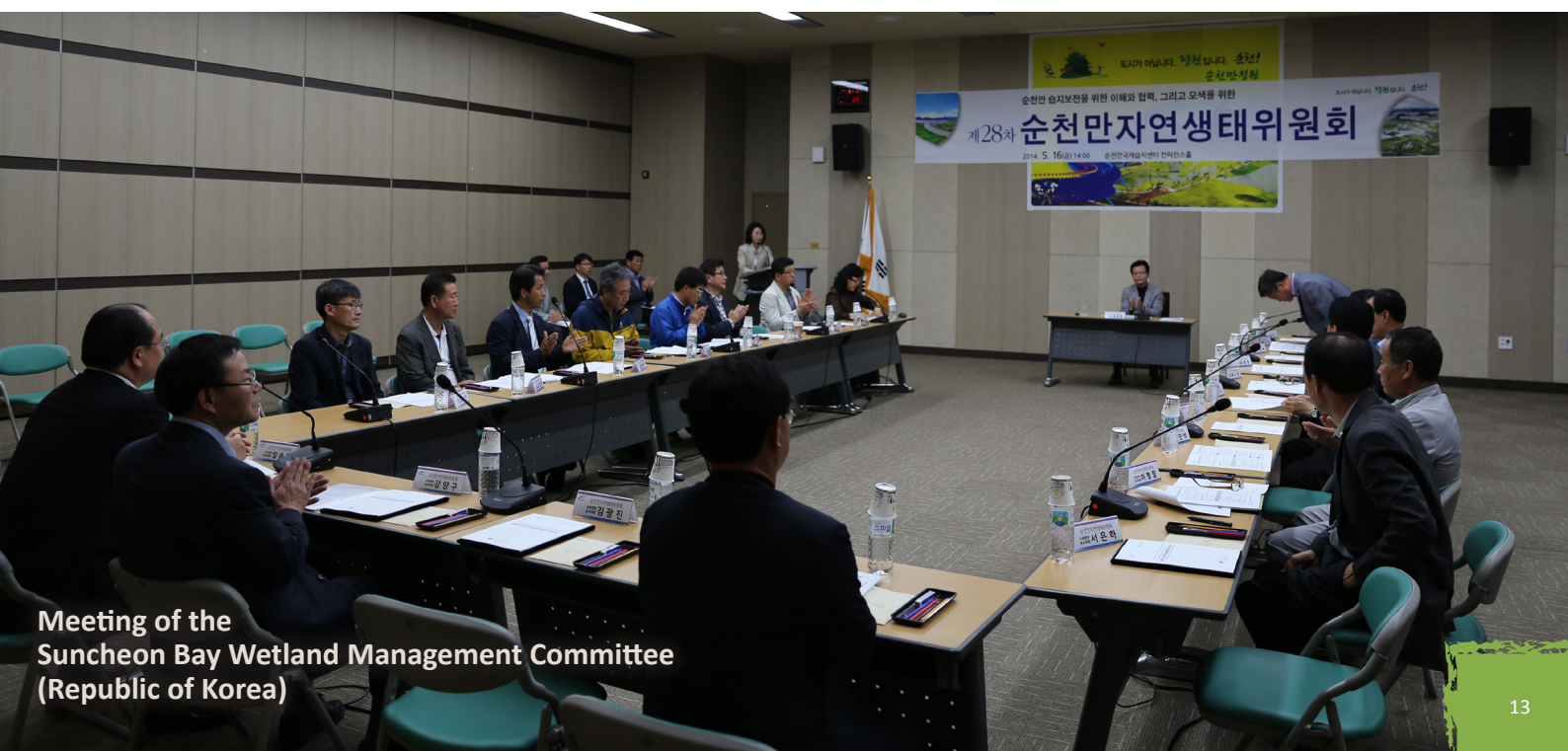
Meeting of the Suncheon Bay Wetland Management Committee (Republic of Korea)