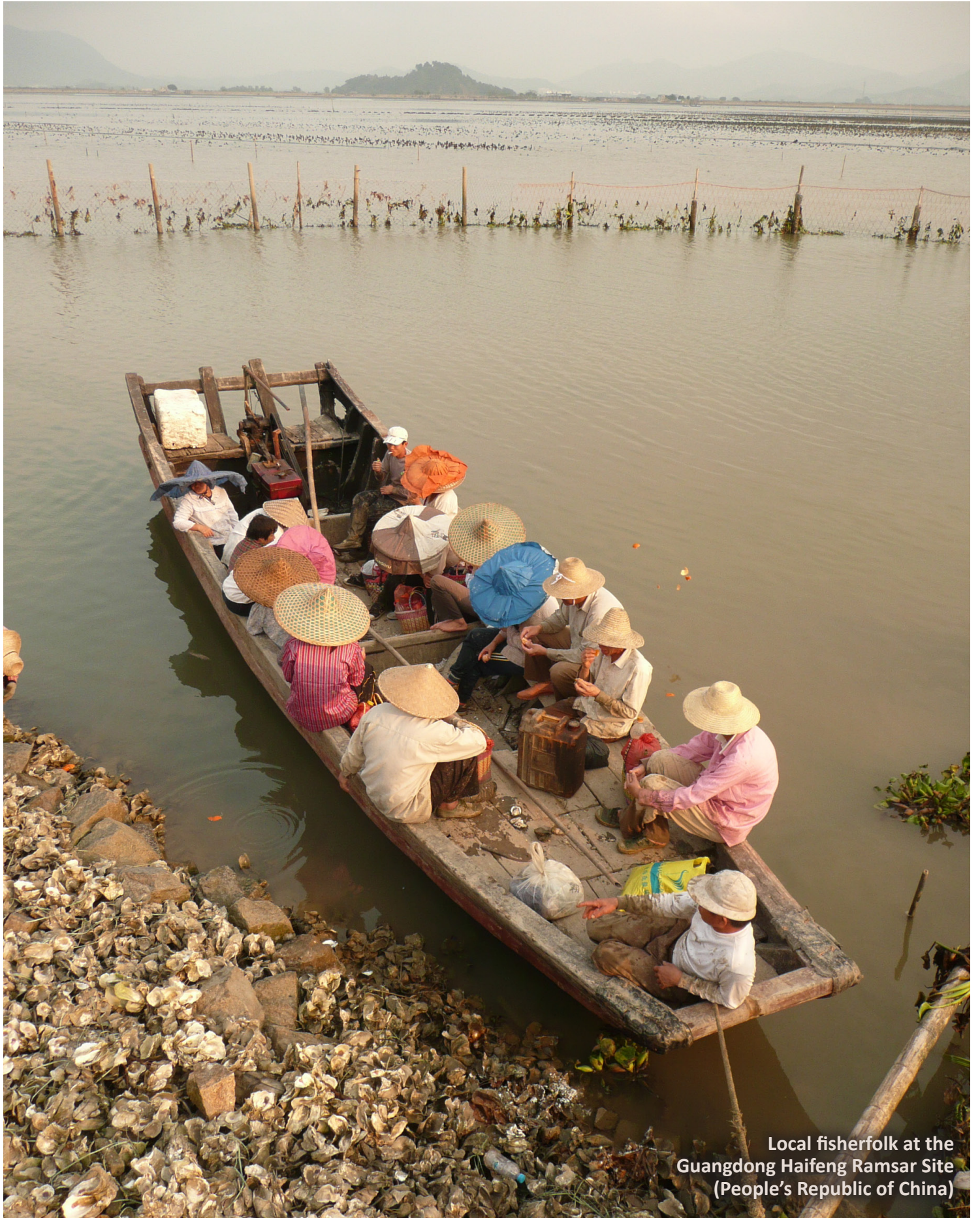
Local fisherfolk at the Guangdong Haifeng Ramsar Site (People's Republic of China)