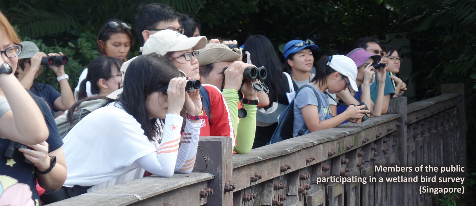
Members of the public participating in a wetland bird survey (Singapore)