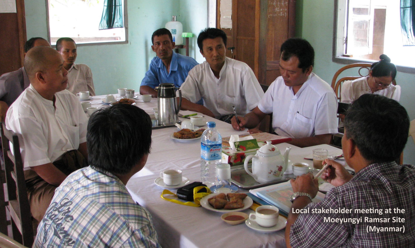
Local stakeholder meeting at the Moeyungyi Ramsar Site (Myanmar)