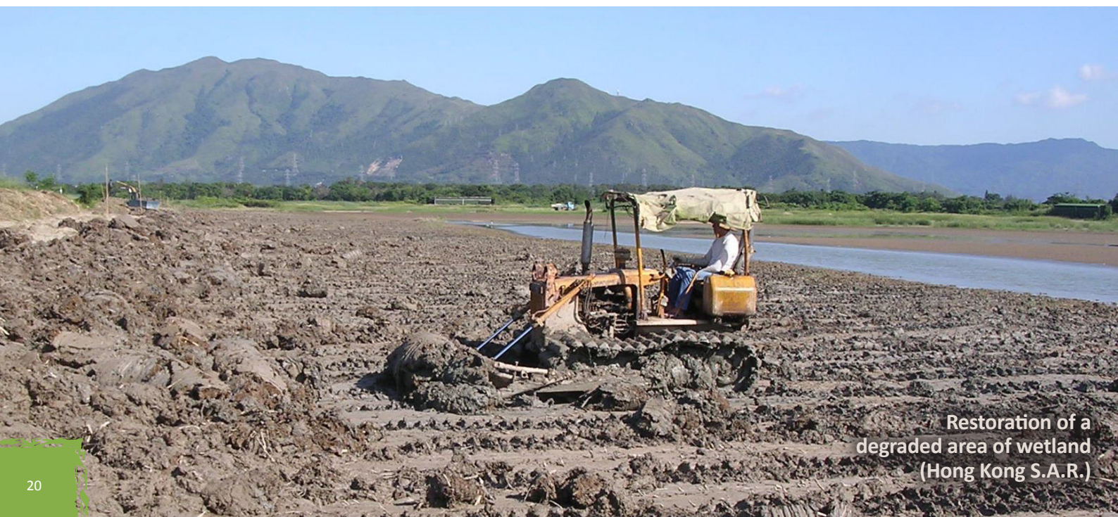
Restoration of a degraded area of wetland (Hong Kong S.A.R.)

It is common practice to select a handful of performance indicators for later assessment (Step M4.1). If a target is expected to vary e.g. due to natural conditions, limits of acceptable change can be set.