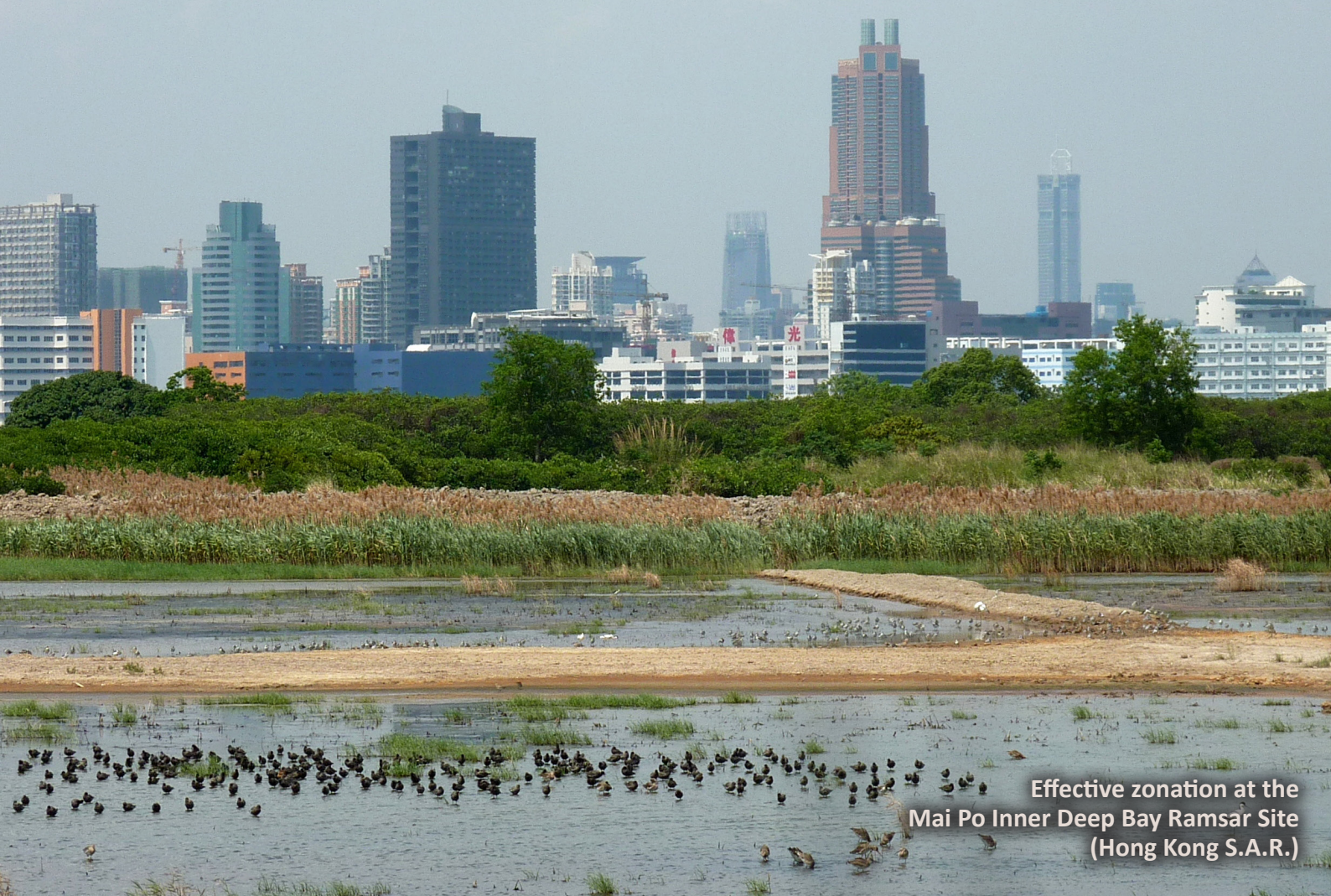
Effective zonation at the Mai Po Inner Deep Bay Ramsar Site (Hong Kong S.A.R.)