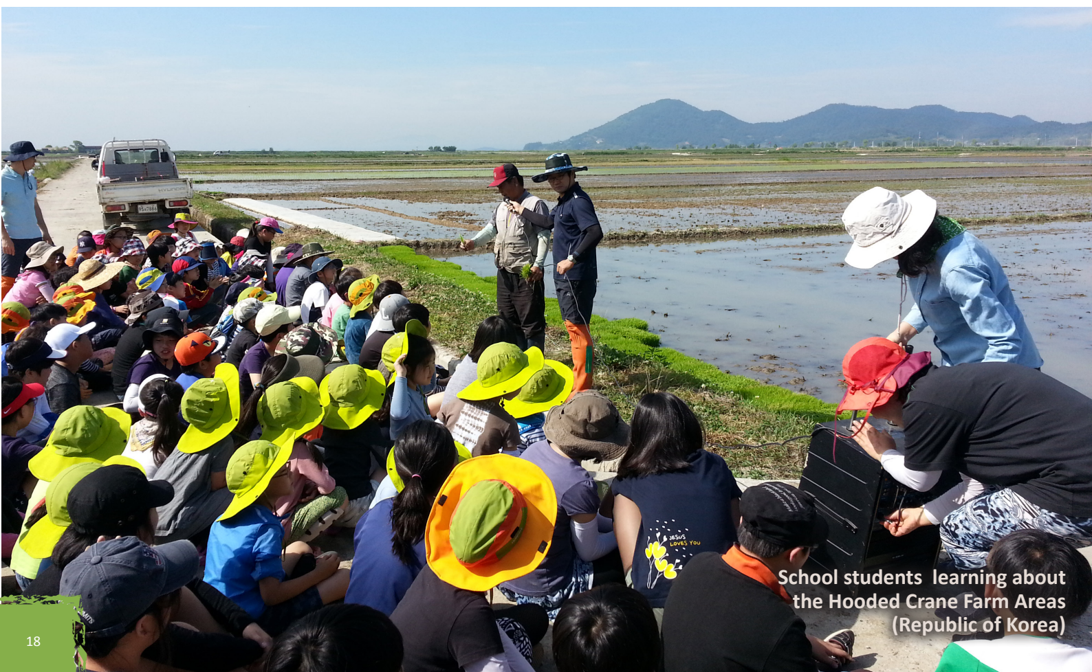
School students learning about the Hooded Crane Farm Areas (Republic of Korea)