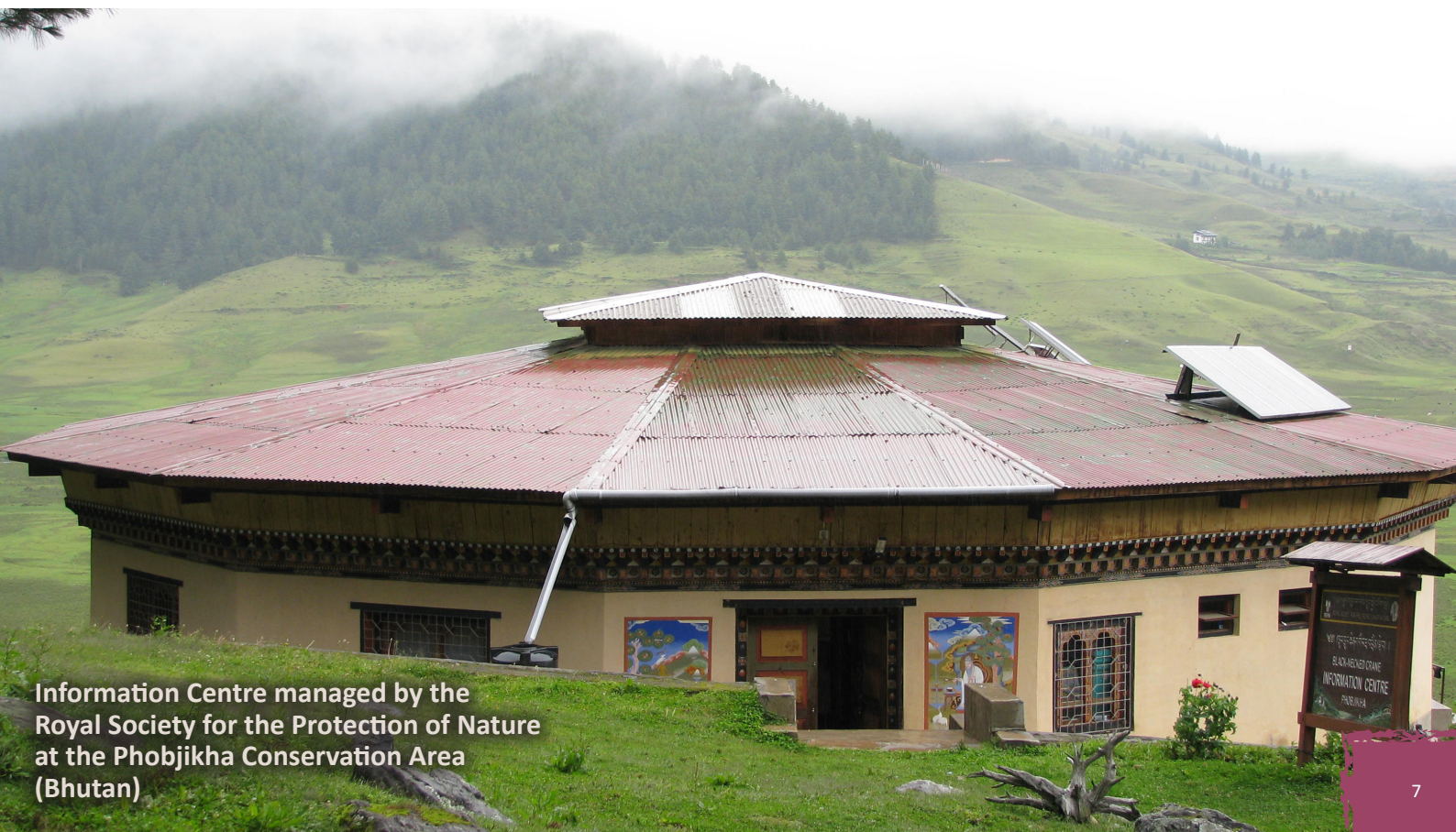
Information Centre managed by the Royal Society for the Protection of Nature at the Phobjikha Conservation Area (Bhutan)

Wetland Link International ( wli.wwt.org.uk ) is a well-established support network for wetland education centres to help improve engagement activities on-site. The network has over 350 members from across 5 continents and shares best practice on wetland education and awareness-raising activities, and provides moral support to its members.