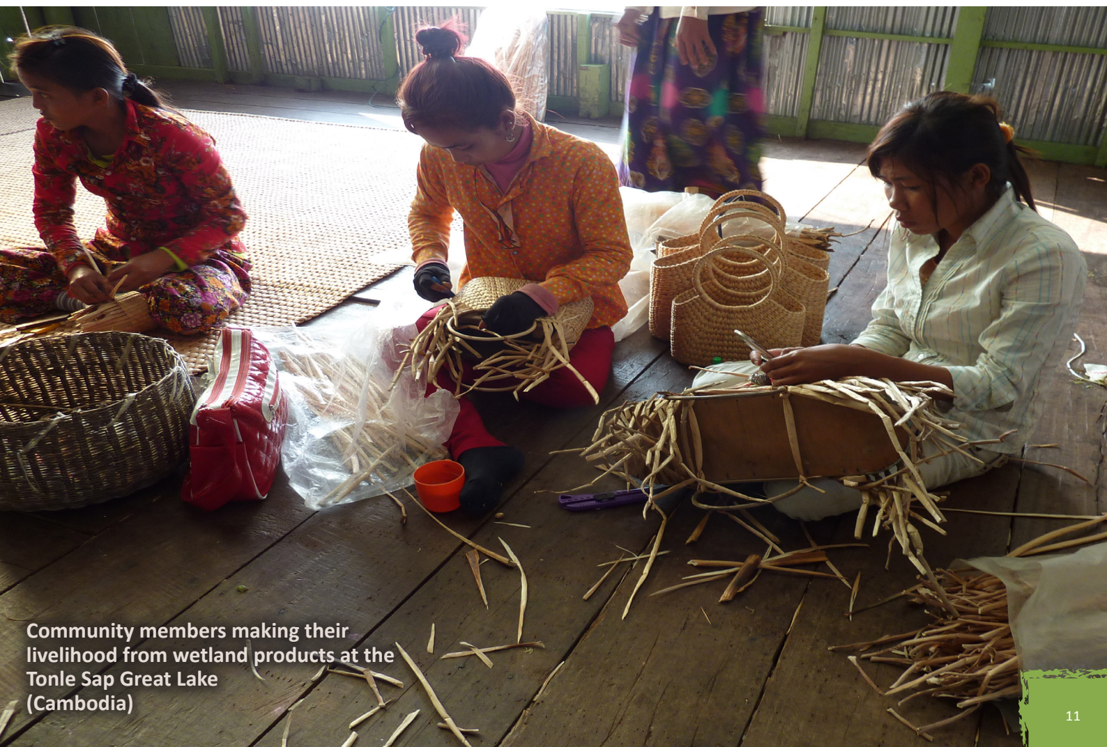
Community members making their livelihood from wetland products at the Tonle Sap Great Lake (Cambodia)