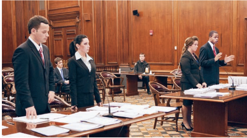
Competitors from other law schools travel to Buffalo for the Buffalo Niagara Mock Trial Competition, the largest national competition held in the fall.

In a "Train the Trainers" gathering, three nationally known teachers of trial advocacy – two from Stetson University and one from the University of Maryland Law School – engaged 19 SUNY Buffalo Law adjunct professors over three days on best practices in the teaching of these skills. Fourteen law students – members of the school's trial technique competition teams – gave opening statements and performed witness examinations, the adjunct faculty critiqued their performances, and