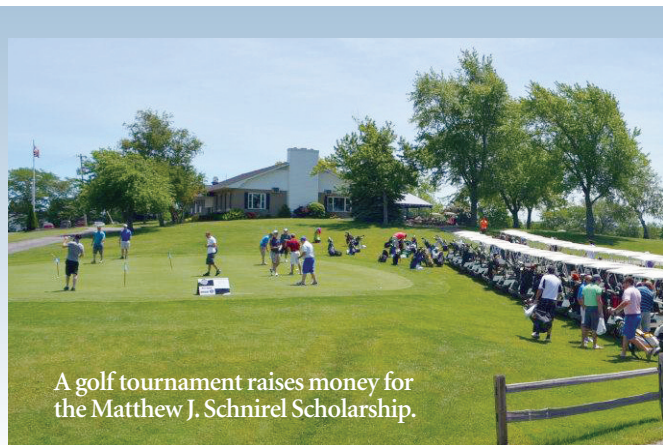
A golf tournament raises money for the Matthew J. Schnirel Scholarship.