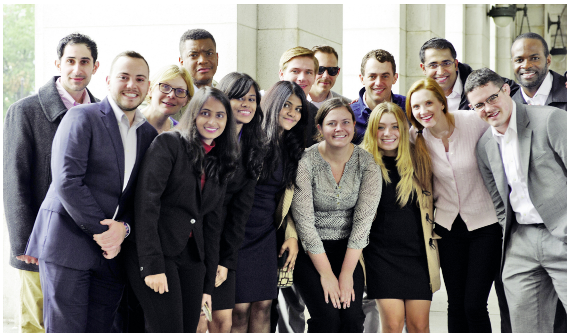
Law and management students visit with financial regulators in Washington, D.C.